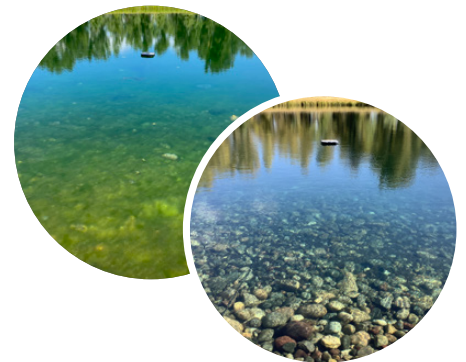
Wilson Pond -- Spirogyra