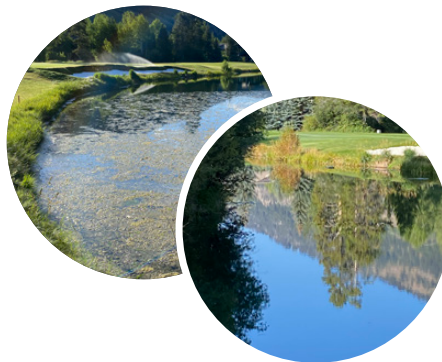
Teton Pines -- Blue-Green Algae